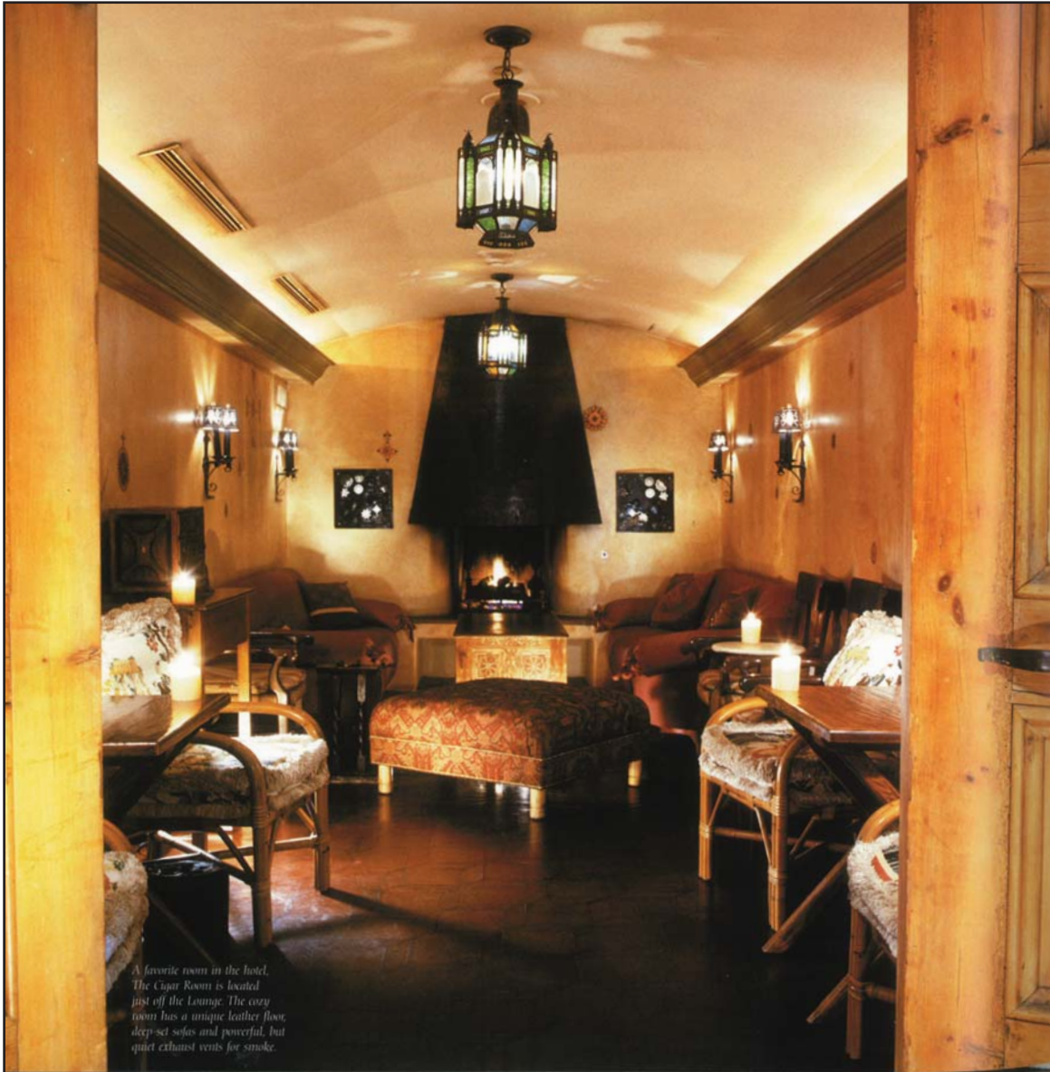
A favorite room in the hotel, The Cigar Room is located just off the Lounge. The cozy room has a unique leather floor, deep-set sofas and powerful, but quiet exhaust vents for smoke.